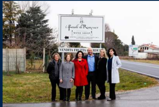
View the StoryMap created by a CONSULTANCY team