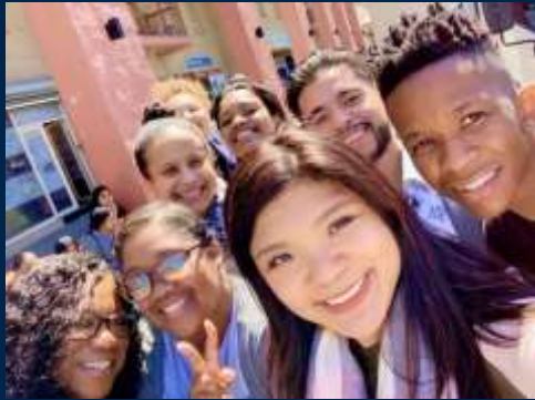
STUDY ABROAD South Africa