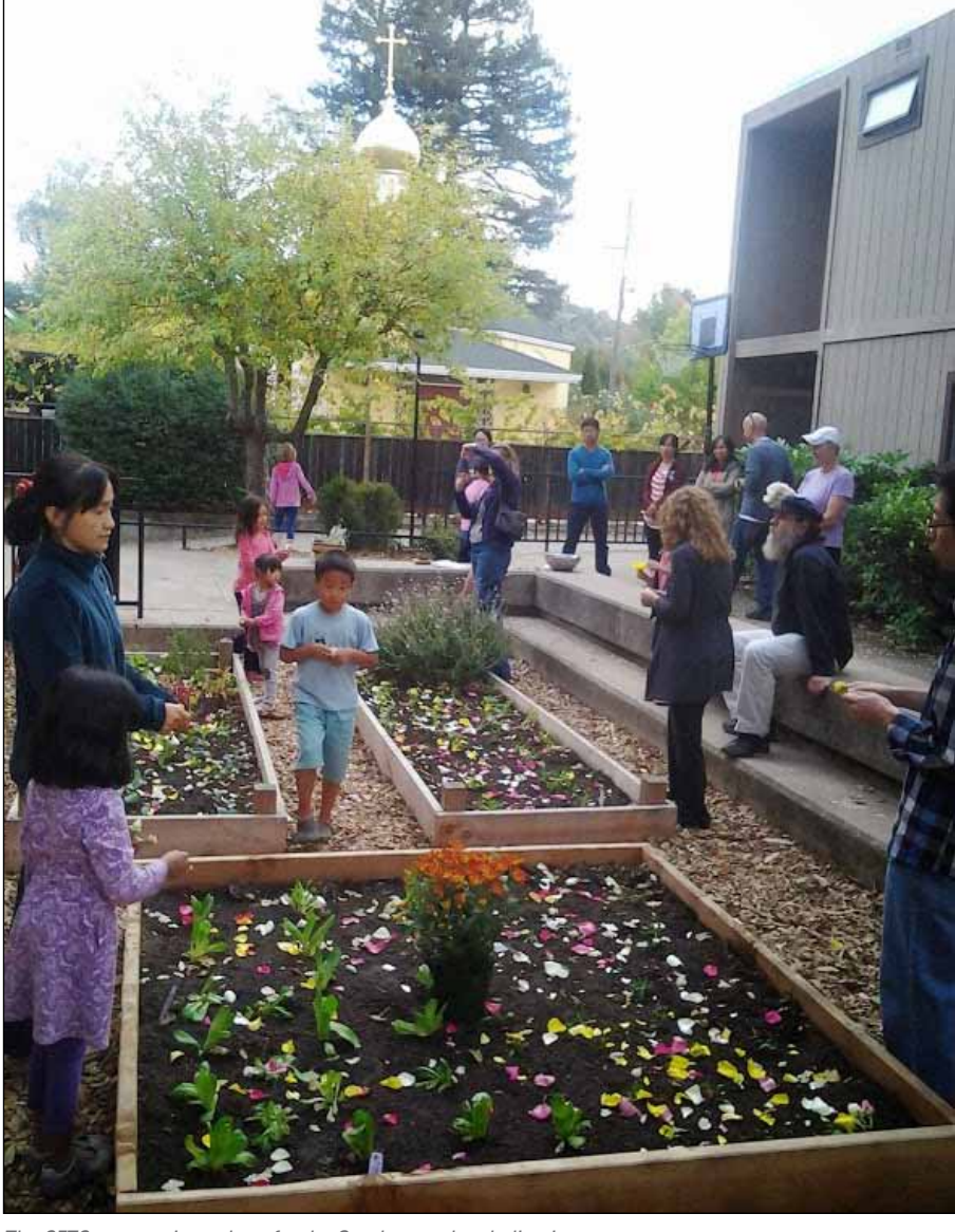
The SFTS community gathers for the October garden dedication.

"It was like a flash mob," Morris says, laughing. "They just showed up and started digging."