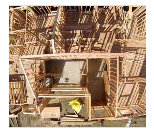
Aerial views show the construction of the student village as it progressed throughout fall of 2014.